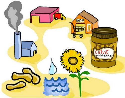
SUPPLY CHAIN OF PEANUT BUTTER

Ask each group to choose an ingredient and brainstorm how it gets to a lemonade stand.